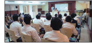
C V Raman College of Engineering- Bhubaneswar Largest installed lab in Eastern India - appx. 4000 Sqft.