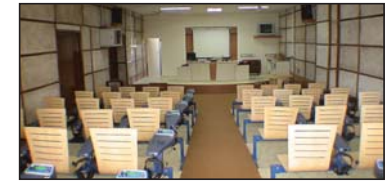
IIT Kharagpur ISIL application and assesment centre