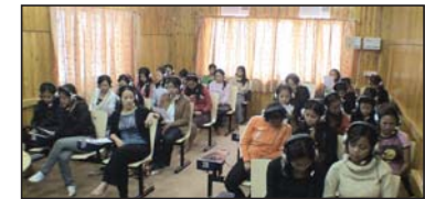
Womens Polytechnic - Aizwal First women college to adapt ISIL lab