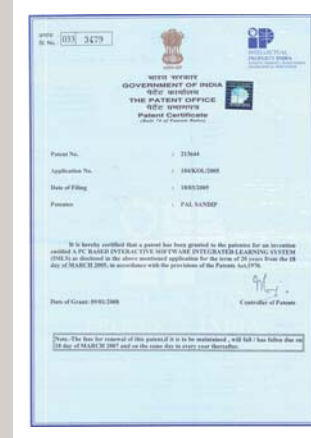
ISILS Patent Certificate