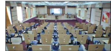
Kalyani Govt. Engineering College Under TEQIP having maximum seating capacity (80 seat)