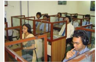
Lab in 1980s dedicated for learning languages

Our goal is to develop the personality of an individual through interactive classes