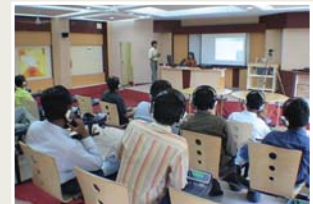
Recent open environment lab for language and communication skill development

The idea of developing language communication has evolved with changing times and technology. The traditional cubicle set up of a language lab is no longer relevant.